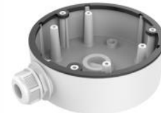
DS-1280ZJ-DM21 Junction Box