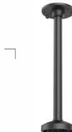
DS-1271ZJ-140(Black) Pendant Mount