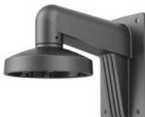
DS-1273ZJ-140(Black) Wall Mount