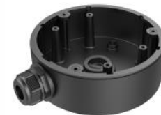
DS-1280ZJ-DM21(Black) Junction Box