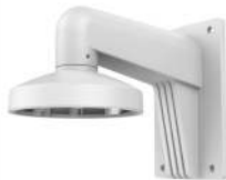
DS-1273ZJ-140 Wall Mount